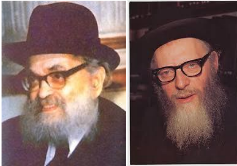
Rabbi Yaakov Kamenetzky Rabbi Shneur Kotler

A few years after Rabbi Shneur Kotler, O”BM, succeeded his late father Reb Aharon as the Rosh Yeshiva of the Lakewood Yeshiva, the Yeshiva’s enrollment began to expand. No longer was Reb Shneur able to sit and study in the large Yeshiva all day. He was suddenly forced to raise funds, day in and day out, often leaving early in the morning and returning home past midnight.