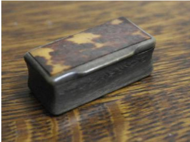
Antique snuff box